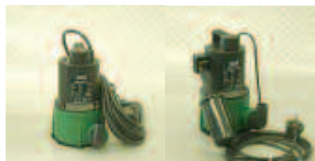
Pictured above: DAB Nova Submersible Pumps

Crossing supply a full range of DAB Booster Sets for all applications